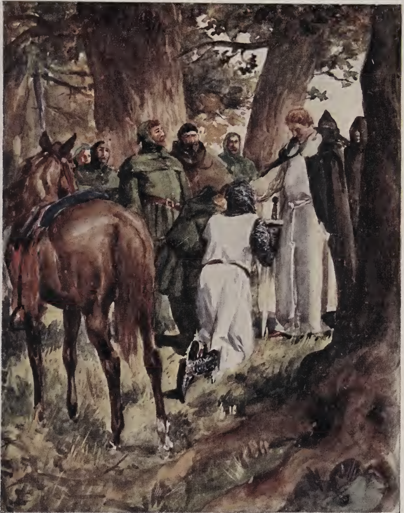
"IT IS THE KING!" CRIED WILL SCARLET, FALLING UPON HIS KNEES.